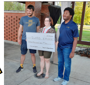
Self-Advocates on ILADD's Board Accept Grant