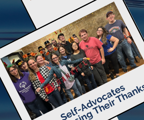
Self-Advocates Expressing Their Thanks