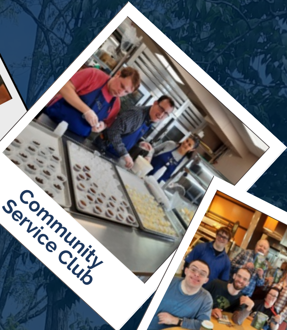
Community Service Club