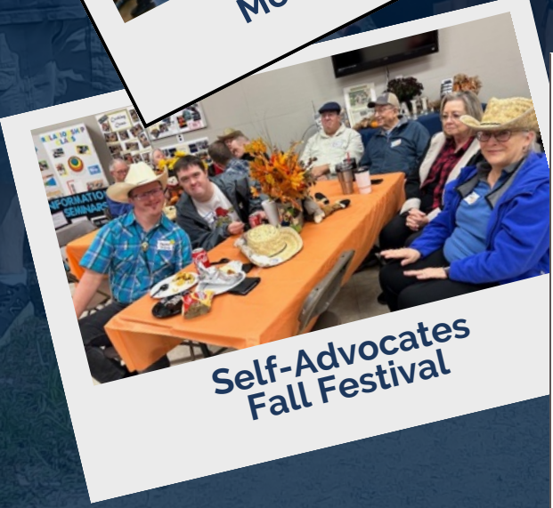
Self-Advocates Fall Festival